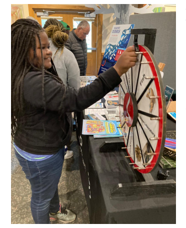
In Pictures: April 2023

From Ohio to Vermont, take a look at how Ohio and Lake Champlain Sea Grant programs celebrated Earth Day! And, learn why we celebrated phytoplankton, the tiny organisms that play a big role in our planet's ecosystems.